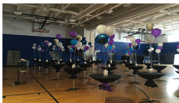
8 th Grade Farewell Celebration!!