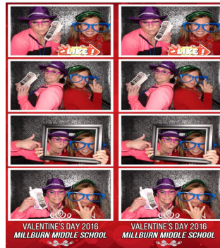
Surprise Holiday Celebrations!!