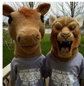
Family Fun Run!!