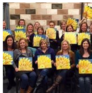
Recess Balls, Spirit Wear, WFC and Parent Night Out!!